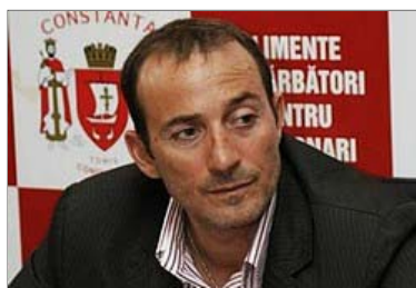
Constanta mayor Radu Mazare.

Radu Mazare, mayor of the Black Sea port city of Constanta, paraded publicly down the catwalk as a fully attired, goose-stepping Nazi officer. Mazare, 41, was joined by his son, who was dressed in a similar suit.